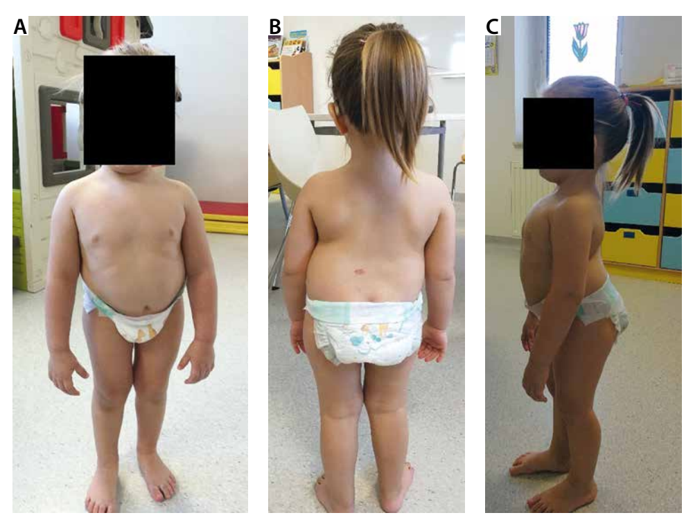
FIGURE 1. Photo of the patient from the front, back, and side – excessive curvature of the spine, shortened trunk and neck, deformed chest, deepened spinal lordosis, prominent abdomen, and limbs of the correct length giving the appearance of being elongated

also noticeable. Anomalies of the ribs and reduced curvature of the spine were recognized by the consulting orthopaedic surgeons. The girl was also under the care of an otolaryngologist due to hearing loss, a urologist due to a slight broadening of the calico-pyelic system of the right kidney, and a cardiologist due to haemodynamically insignificant patent foramen ovale.